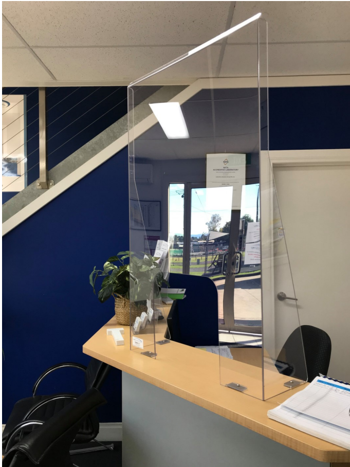
SafeSell 600 995 x 595 x 195